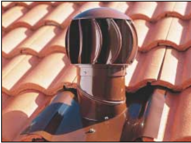
THE TURBOVENTURA TURNS IN THE LIGHTEST OF BREEZES TO EXHAUST AIR FROM BATHROOMS