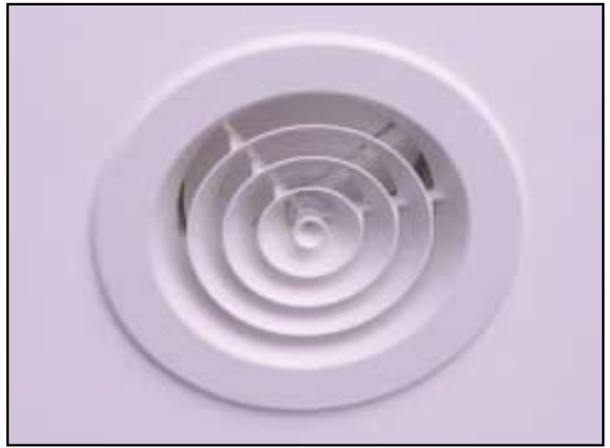
THE 150MM DIAMETER CEILING REGISTER CAN BE SIMPLY OPENED AND CLOSED TO SUIT CONDITIONS.